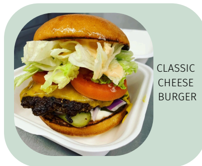
CLASSIC CHEESE BURGER