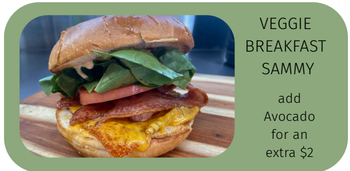
VEGGIE BREAKFAST SAMMY

Two Over-Easy Fried Eggs, 3 strips of Bacon, Sourdough Toast, Two Hashbrown Patty